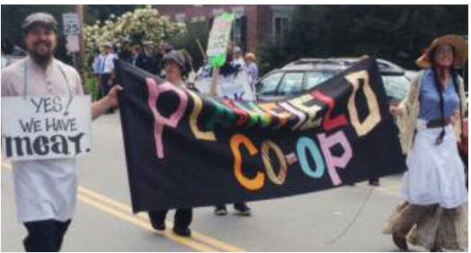
Plainfield Old Home Day, 2013

Here at the Plainfield Co-op bakery department we've been working to supply our customers with endless bread or at least with a hearty selection of grainy goodness on any given day. All of the bread that we offer is locally baked so it's wonderfully fresh. Come in on Monday, Wednesday, or Friday and just TRY to resist the aroma of Whizzo Bagels! Swing by Thursday on your way home and grab a four pack of Klingers Bakery croissants to surprise your family with for breakfast or dinner, always a hit at my house! Friday morning we stock the bread shelves to the ceiling to ensure that there's bread on your table all weekend. It really is a sight to behold, more bread than you can shake a baguette at, all displayed in style on our new—PURPLE!—bread racks. Next time you run into Ian Maas, give him a big hug, hearty handshake, a clap on the back, and thank him for building us those gorgeous shelves! He certainly