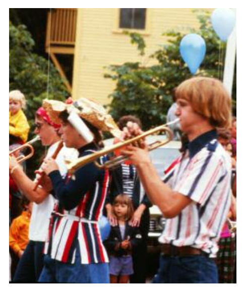
Plainfield 4th of July parade, 1976