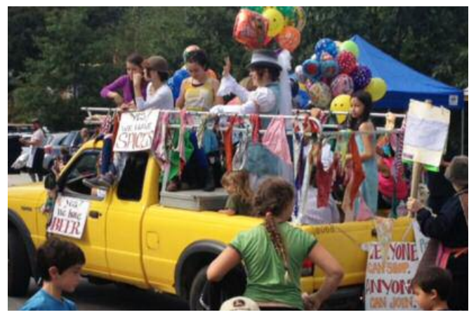
Plainfield Old Home Day, 2013 Co-op float

Mochi. I am occasionally asked whether we stock mochi in the store, and I can now answer yes to mochi lovers assorted flavors, in the freezer, all for you!! ◆